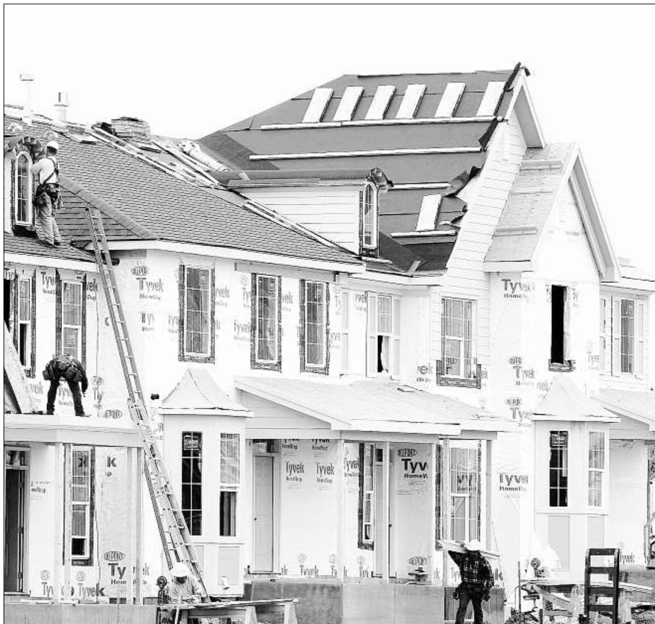
The multi-family market is booming in the Calgary area with 11,915 units currently under construction.

The proposed partnership "threatens to create a monopolistic concentration of power" that would drive up online ad prices for small farms and rural businesses, the groups said Monday in a letter to Senator Patrick Leahy and Representative John Conyers. Yahoo, seeking alternatives to a takeover bid from Microsoft Corp., held a test program in April using Google software to place ads next to Yahoo search results.