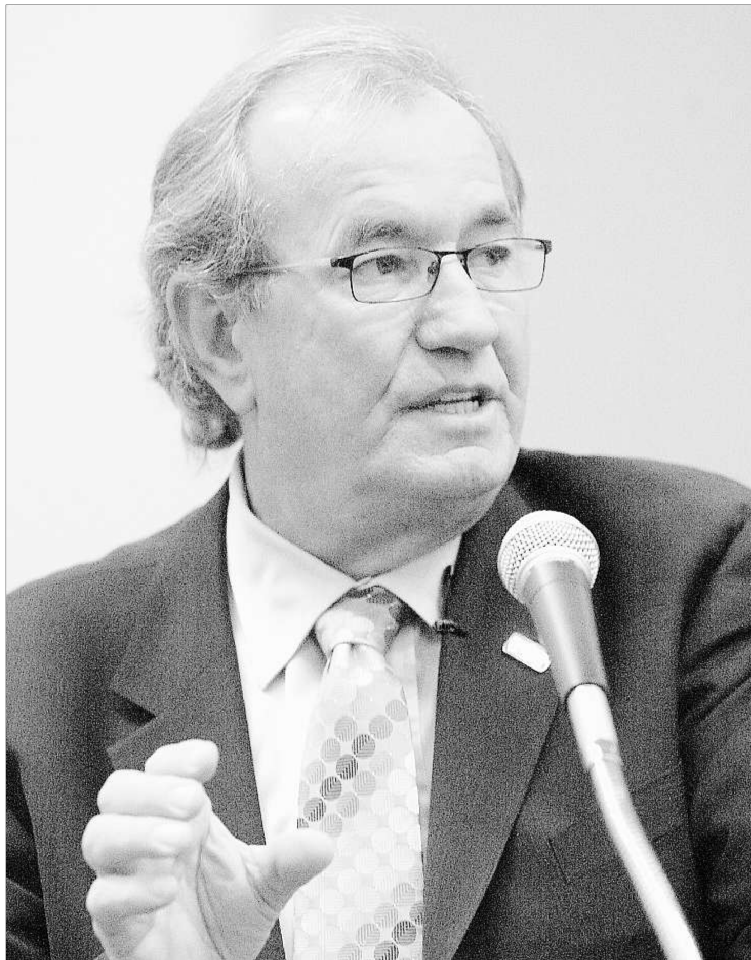
Canadian Auto Workers president Buzz Hargrove calls labour deals with GM and Chrysler "a win-win situation in difficult times."

The terms of the settlement with residents of Kivalina, a village 80 kilometres from the mine in northwest Alaska, weren't disclosed.