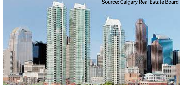
Artist's rendering, BKDI Architects