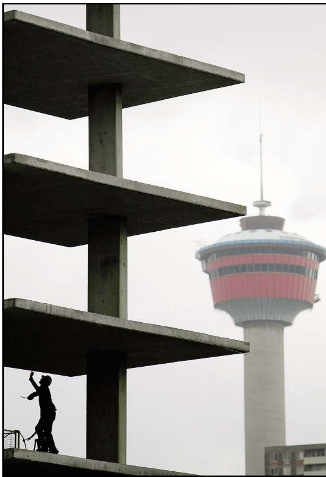
The value of building permits in Calgary rose 18.3 per cent in 2007.