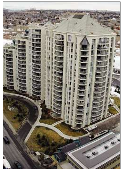
Movement of tenants into home ownership is one reason vacancies are rising.

At the same time, 1,570 apartments and 347 townhouses were taken out of the rental pool in the past 12 months because they were converted to ownership, it says.