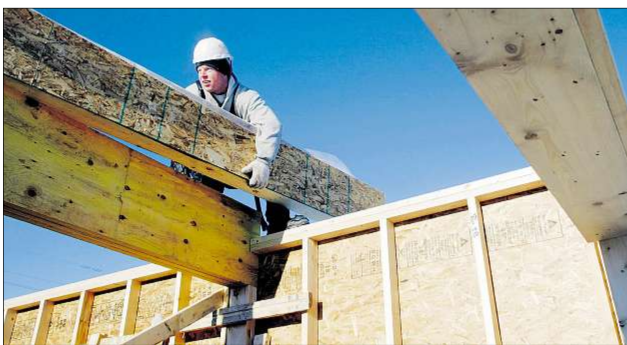
A worker helps frame a house in Tuscany in 2005. The Calgary community is to be completed in 2008.