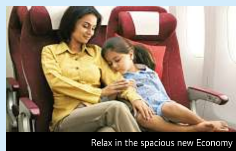
Relax in the spacious new Economy

For a memorable and relaxing flying experience choose Jet Airways and change the way you fly.