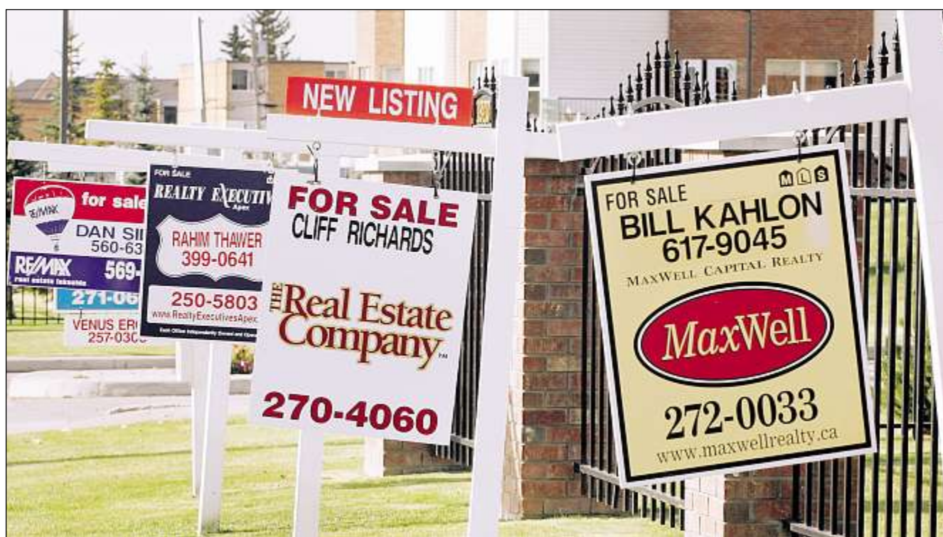
The Canadian Real Estate Association is forecasting record levels of MLS sales across the country this year with Alberta expected to lead in the rate of average price growth, according to a market report released Monday.