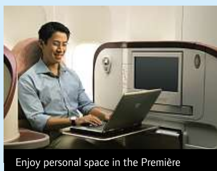
Enjoy personal space in the Première

And more recently the Freddie Award** for our frequent flyer program third time in a row.