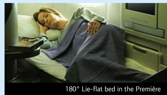
180° Lie-flat bed in the Première

You can also enroll into our award-winning JetPrivilege program and accrue JPMiles when flying with Jet Airways or any of our 10 frequent flyer program airline partners*.